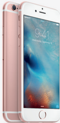
Apple iPhone 6s