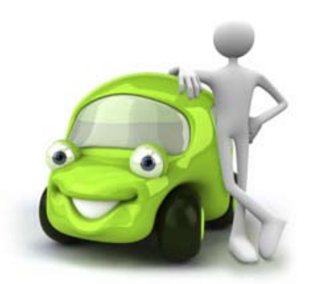
$100 Hybrid Auto Loan Rebate*

While we can't do anything about gas prices, we can help you finance your new or used hybrid or fuel efficient vehicle with low rates and flexible terms up to 84 months. Plus, for a limited time, you'll get $100 cash!